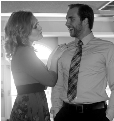
Players from The Show Palace Dinner Theater sing from "Oklahoma" at our September Luncheon.