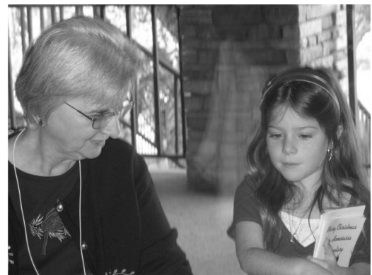
Enjoying Special Guests