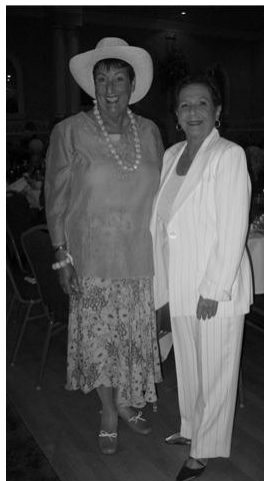
Getting Dressed Up!