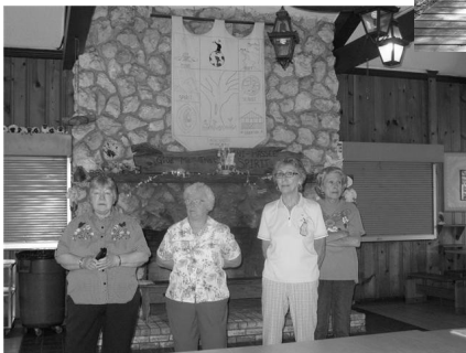
Community Room and Dining Area