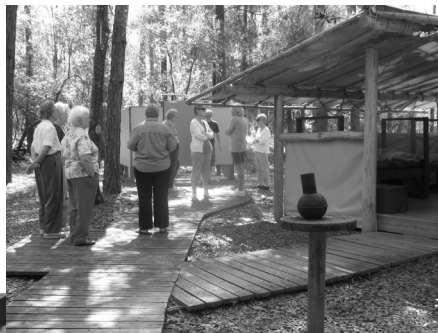
The WSW visit Camp E Nini Hassee: Sleeping Tents

Director of Community Services, 382-5571