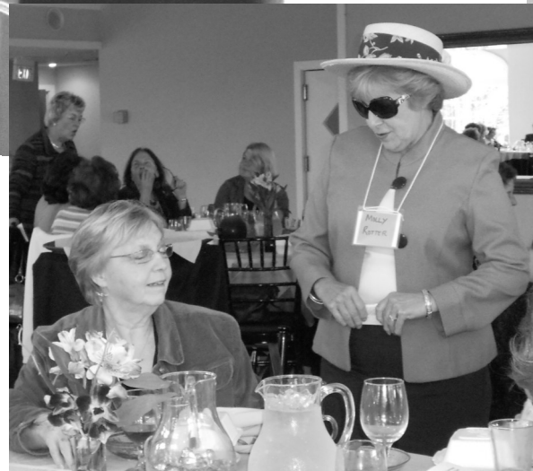
The Murderer—motive: killed Sunny Sails because she knew too much for her own good!