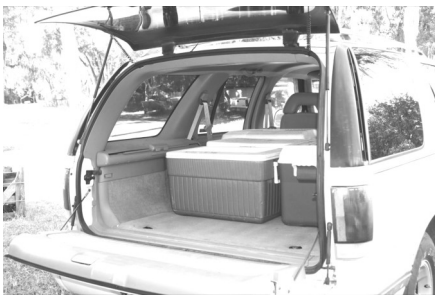
Delivering and sorting incoming food from store