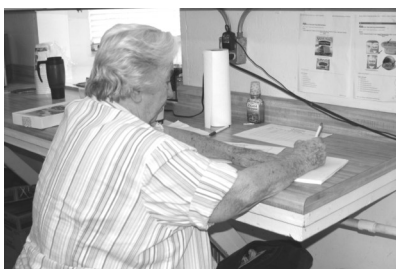
Recording and weighing in the donated food