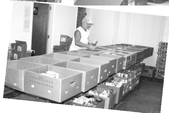
Boxing food to be given away to those in need